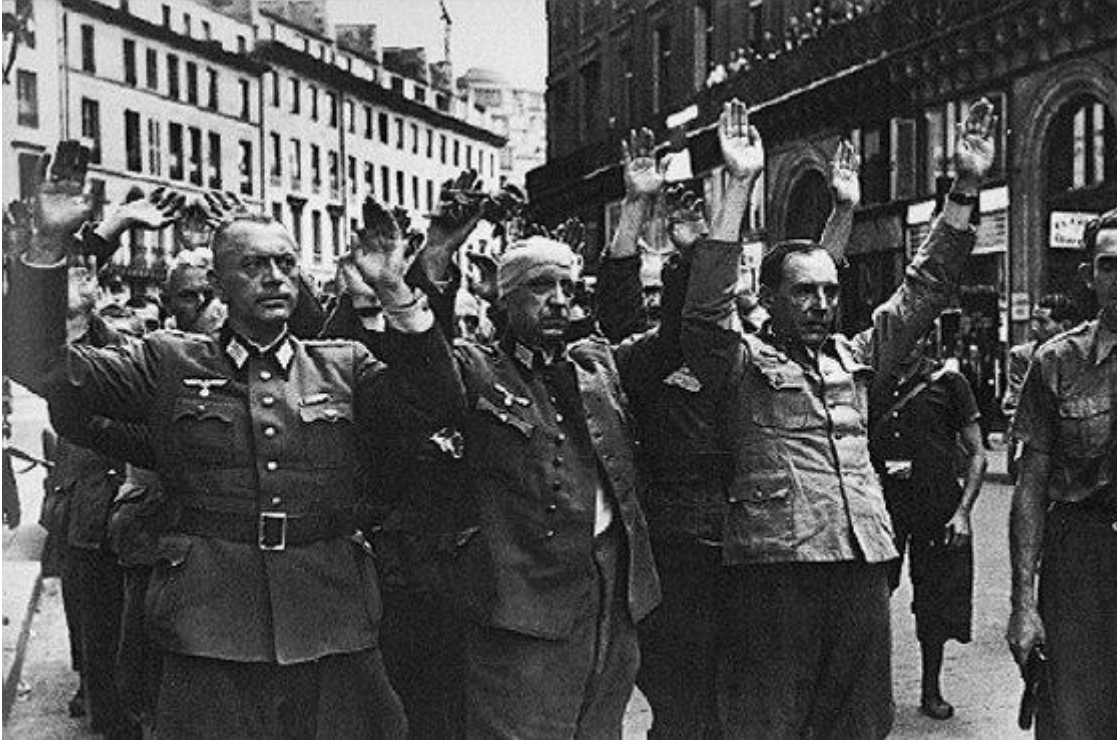
German officers surrender in Paris. France, August 1944.

The Germans surrendered and World War II is over in Europe. The Japanese do not surrender until August.